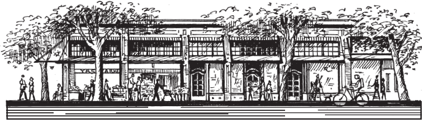
College Avenue in Rockridge (between 63rd Street and Alcatraz Avenue)

Yasai Market Wisteria Southie Wood Tavern Vino! Ver Brugge Foods La Farine